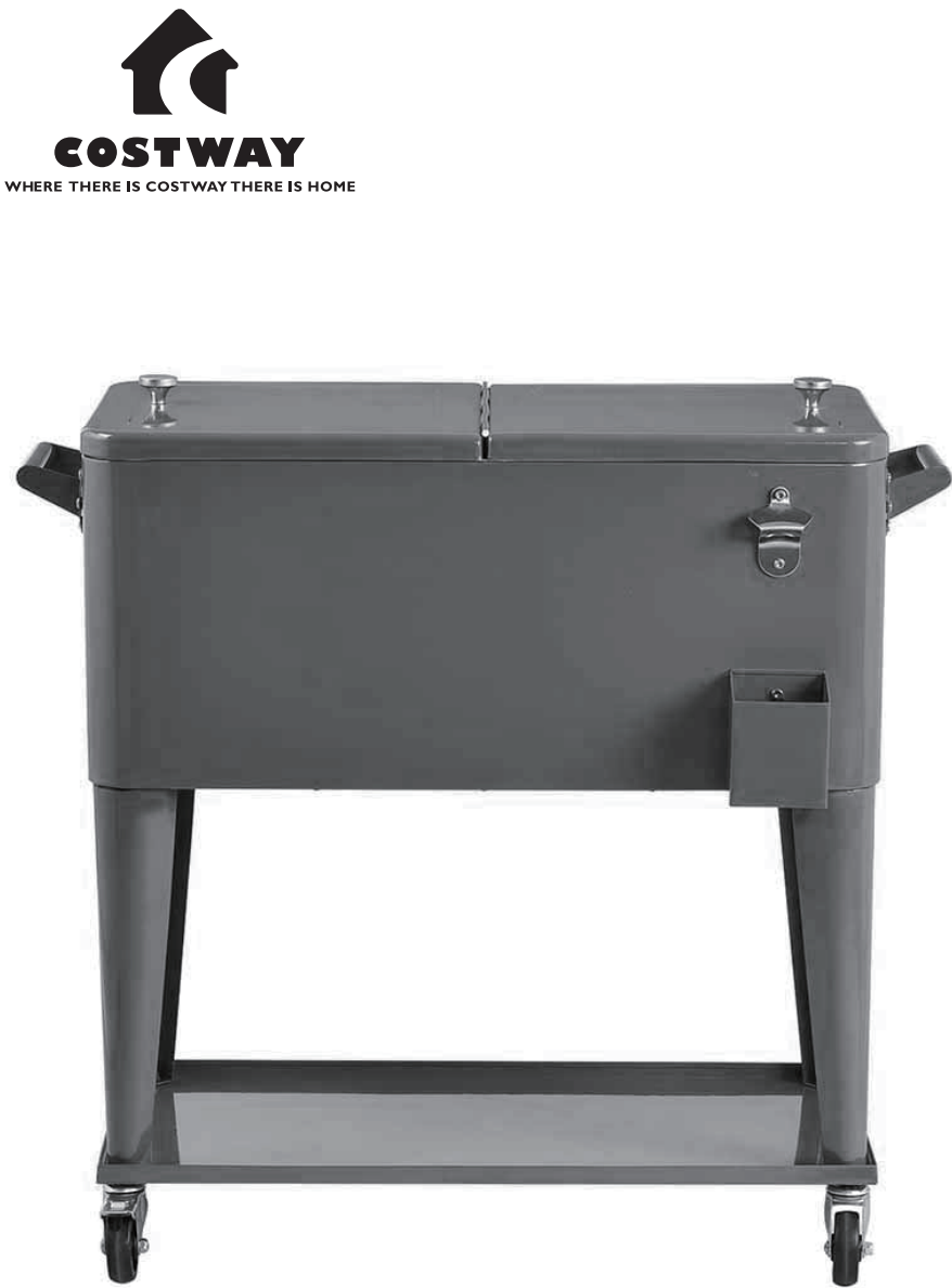
USER'S MANUAL Patio Deck Cooler Rolling Outdoor OP2226

Please read the cooler manual carefully and assemble according to following steps.