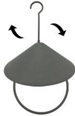
Step2:Tighten the top bolt clockwise