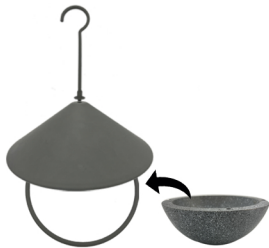
Step3:Attaching the bowl to the support frame