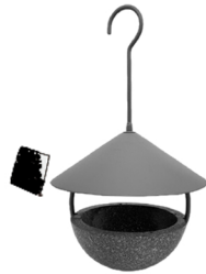
Step4:Pouring food or water into the bowl