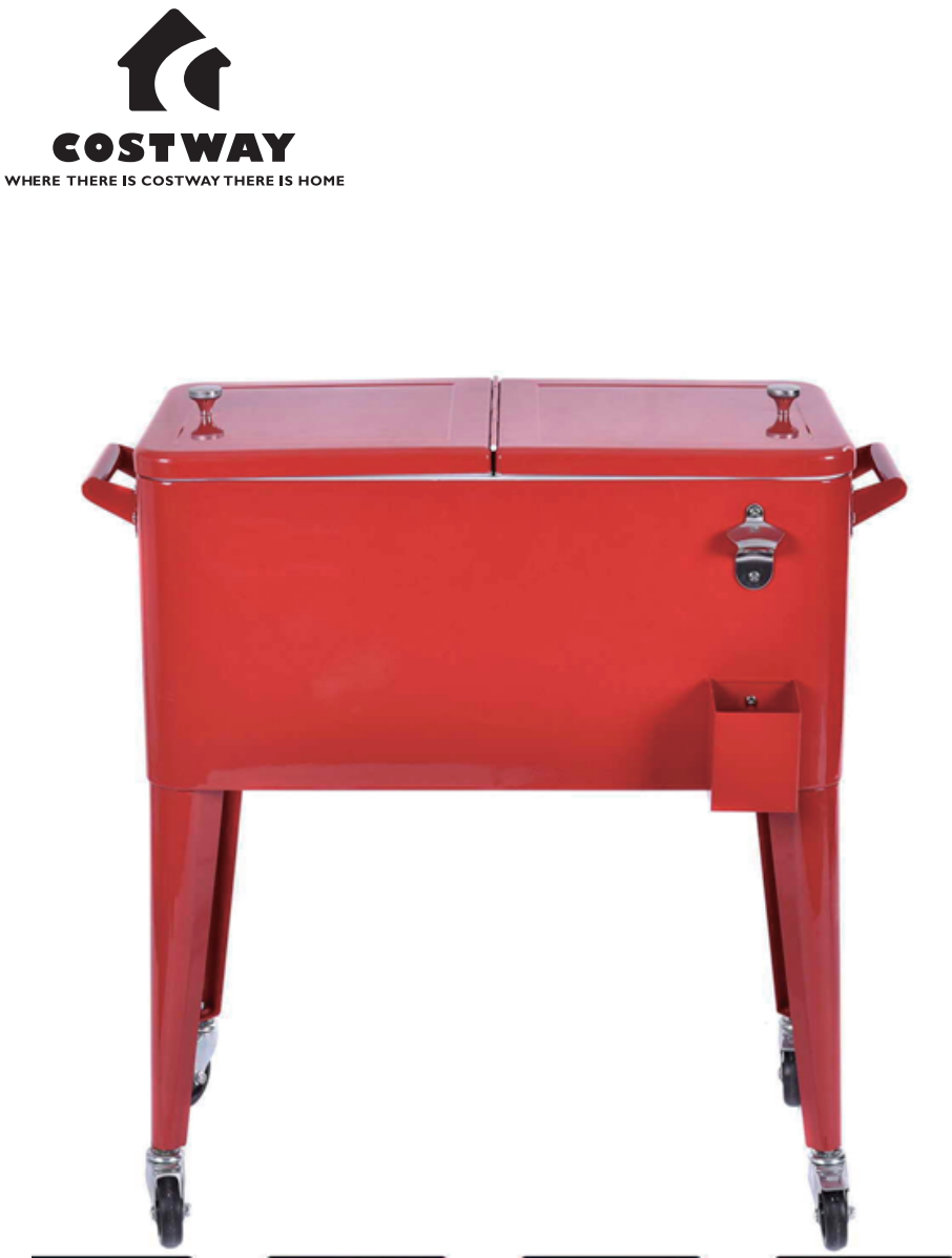
USER'S MANUAL Red Cooler Cart Outdoor OP2979

Please read the cooler manual carefully and assemble according to following steps.