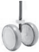
2. Front wheels